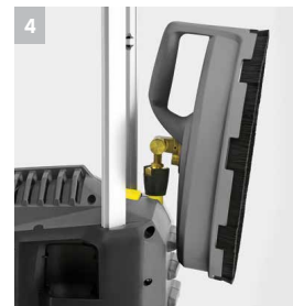
Shown with optional surface cleaner 2.111-016.0