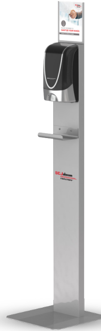
*Dispensers sold separately

SC Johnson Professional dispenser sold separately