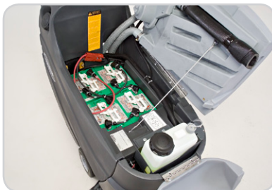
Dual vac motors pull more water out of the carpet. Recovery tank lid design allows easy access to batteries.