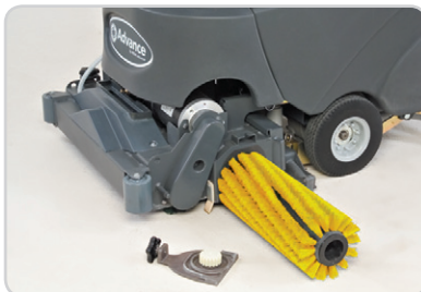
Tools-free removable brushes make for easy clean-up after use.