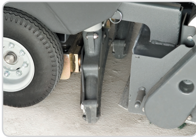
Dual laminar flow vac shoes allow for more efficient recovery of solution.