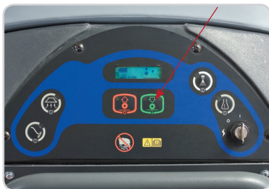
Single touch button control sets proper operation of all functions. Simplifies training and consistent use by all operators.